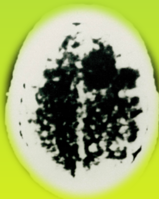
First clinical image—1er october 1971